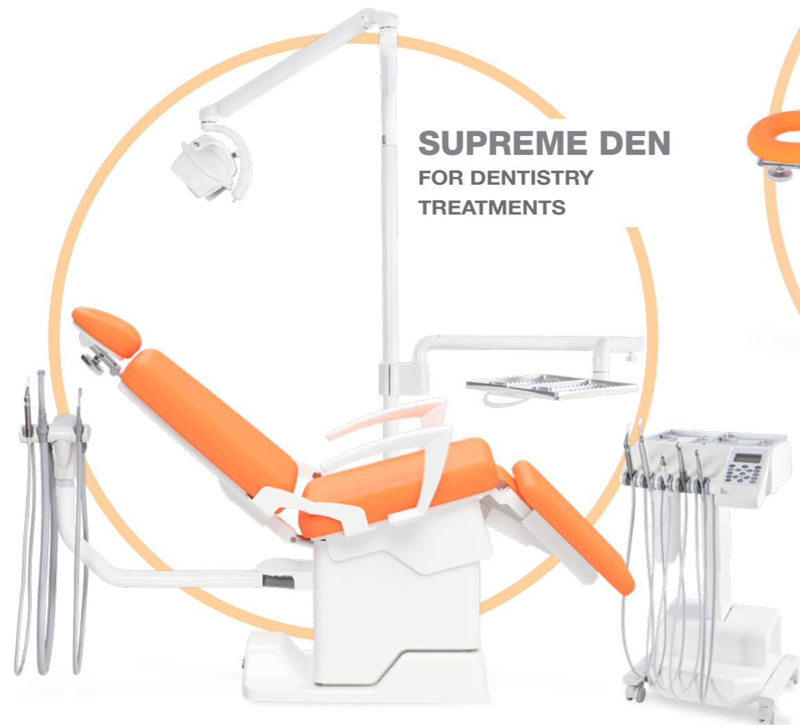
SUPREME DEN FOR DENTISTRY TREATMENTS