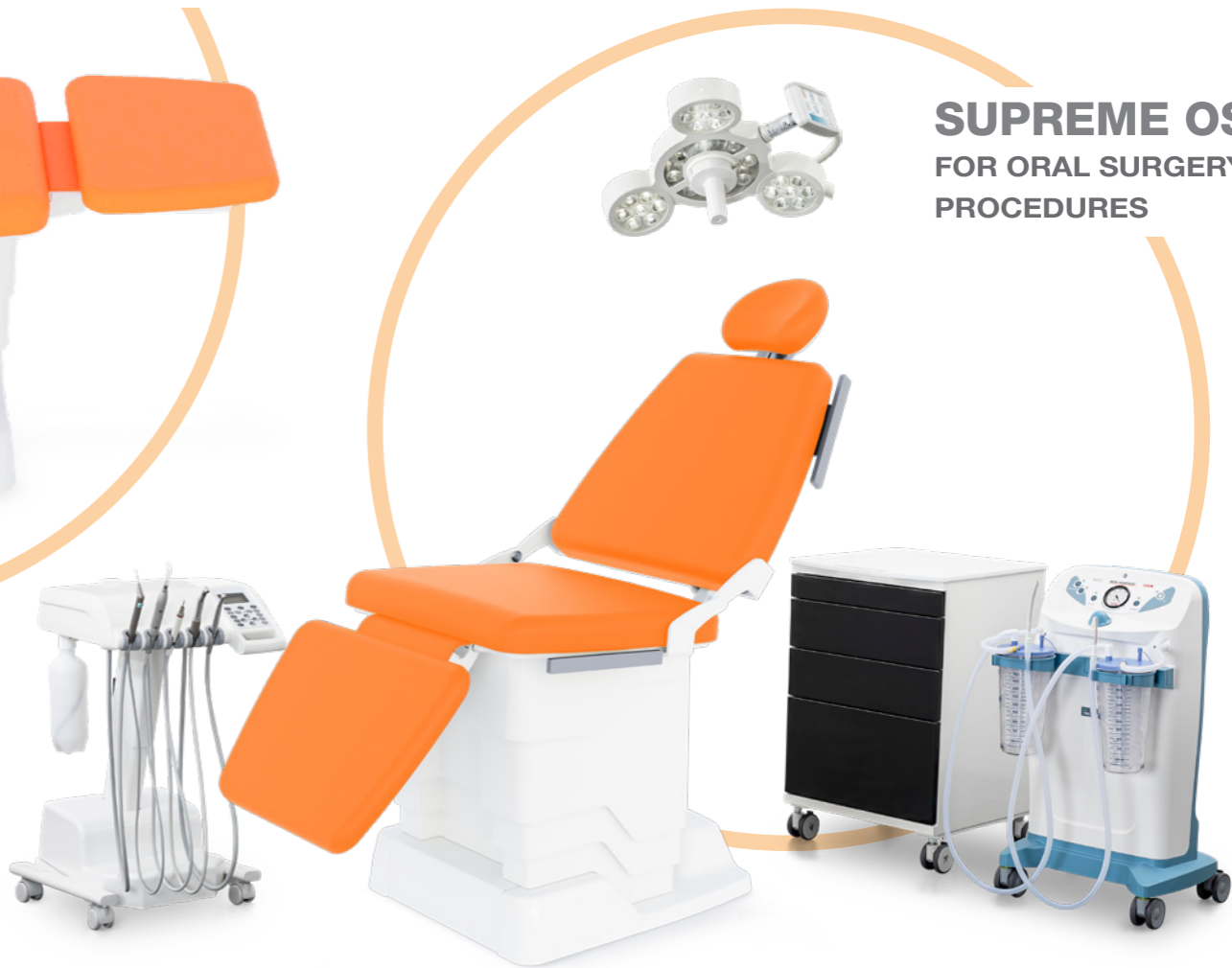
SUPREME OS FOR ORAL SURGERY PROCEDURES