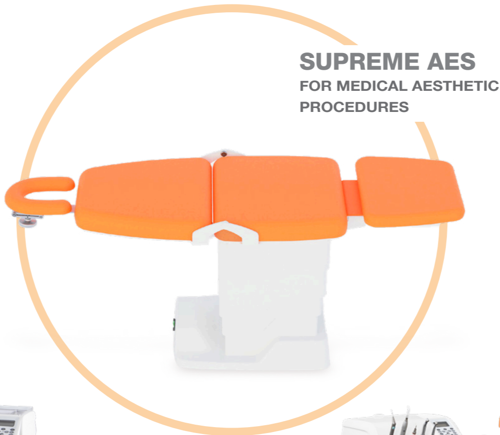
SUPREME AES FOR MEDICAL AESTHETIC PROCEDURES